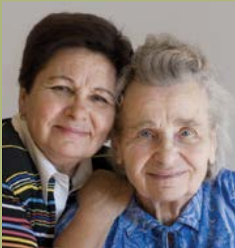
The staff is wonderful! Loving and caring to all the residents.

Located in beautiful Redmond, Oregon at the foothills of the Cascade mountain range, Brookside Place has a quiet, rural setting yet just minutes from downtown. This comfortable community provides affordable licensed assisted living and memory care services in a secure, homelike setting.